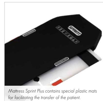
Mattress Sprint Plus contains special plastic mats for facilitating the transfer of the patient.