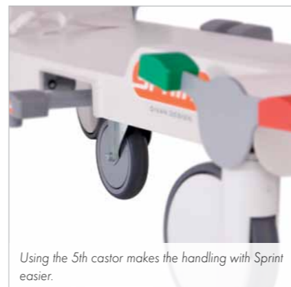
Using the 5th castor makes the handling with Sprint easier.