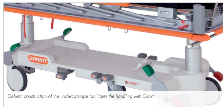
Column construction of the undercarriage facilitates the handling with C-arm.