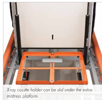
X-ray cassette holder can be slid under the entire mattress platform.