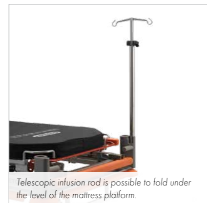
Telescopic infusion rod is possible to fold under the level of the mattress platform.