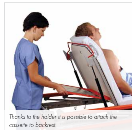
Thanks to the holder it is possible to attach the cassette to backrest.