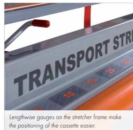
Lengthwise gauges on the stretcher frame make the positioning of the cassette easier.