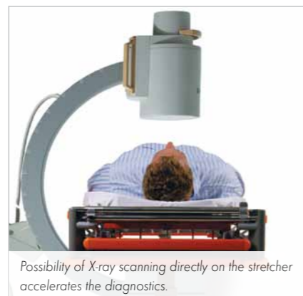
Possibility of X-ray scanning directly on the stretcher accelerates the diagnostics.